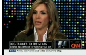
Larry King Live